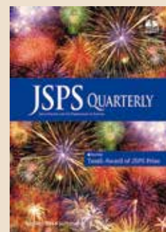
Latest cover design