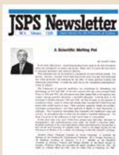
Nobel laureate Dr. Fukui's essay