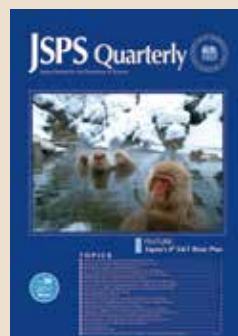
One of the popular cover photos