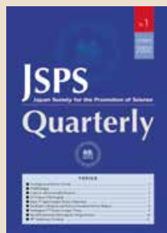
First JSPS Quarterly