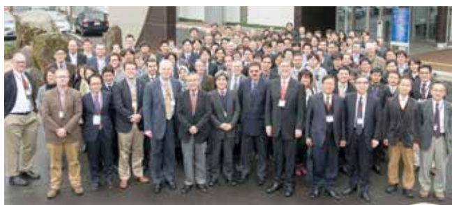
I 2 CNER & ACT-C Joint Symposium held on 30 January 2014

I 2 CNER's mission is to contribute to the creation of a sustainable and environmentally-friendly society by conducting fundamental research to advance the development of low-carbon emission and cost-effective energy systems, while improving energy efficiency. The array of technologies that I 2 CNER's research aims to enable includes Solid Oxide Fuel Cells for power generation, Polymer Membrane-based fuel cells for hydrogen fueled vehicles, biomimetic and other novel catalyst concepts, and the production, storage, and utilization of hydrogen as a fuel.