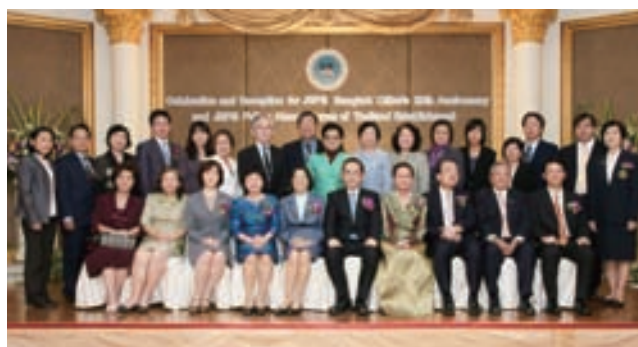
Participants of commemorative ceremony