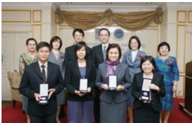
RONPAKU Medal recipients