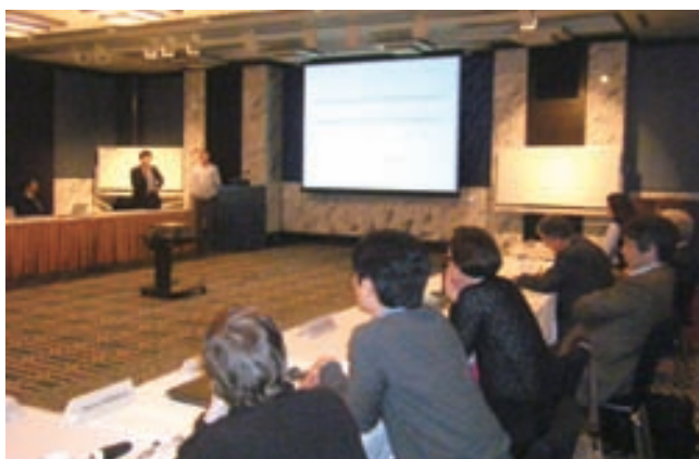
JFFoS planning group meeting

Another feature of the FoS program is its planning groups, whose members are appointed from among the participants of the previous year's symposium. They plan and organize the following year's symposium, including the selection of its session topics and speakers.