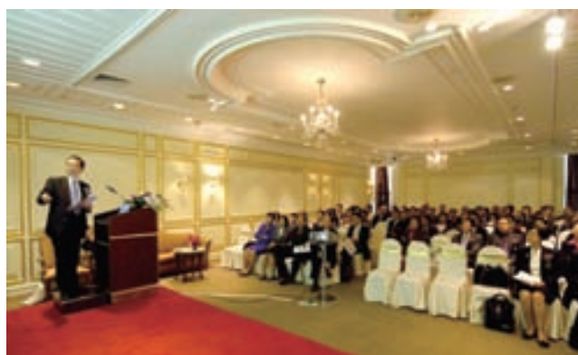
Prof. Ono giving presentation

The commemorative lecture and reception were attended by altogether over 120 people, including former JSPS fellows and program participants, JSPS program operators at Thai universities, and Japanese embassy officials, among others. Both the JAFT inaugural General Assembly and the celebratory reception marked a forward-looking program milestone at the Bangkok Office's 20 th year juncture. While also celebrating the start of the JSPS Alumni Forum of Thailand, the day's events afforded the Bangkok Office staff an ideal opportunity to ask for the sustained support of all involved with JSPS programs in Thailand.