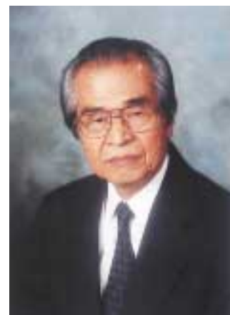
Dr. Masatoshi Nei

Born: January 1931 in Miyazaki, Japan Nationality: U.S. citizen 1994-Present: Evan Pugh Professor of Biology, Pennsylvania State University 1990-Present: Director, Institute of Molecular Evolutionary Genetics, Pennsylvania State University 1990-1994: Distinguished Professor of Biology, Pennsylvania State University 1972-1990: Professor of Population Genetics, University of Texas at Houston 1969-1972: Associate Professor to Professor of Biology, Brown University 1962-1969: Geneticist, National Institute of Radiological Sciences, Chiba, Japan 1958-1962: Assistant Professor, Kyoto University 1959: Received Ph.D. from Kyoto University 1953: Received BS from Miyazaki University