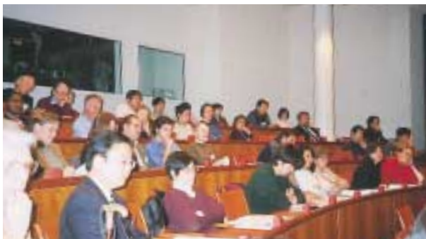
Forum participants listening to lecture