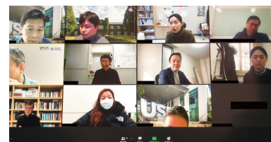
〈The Ace Meeting〉

Conception of the program is being worked toward through regular conferences between the four universities “The Ace Meeting” starting in November, 2021, and intermittent discussion on the development of rubrics, the diploma/ certificate of completion for the Joint Minor Program, and the C 6 ubic Curriculum. It is the building of a way of working that aims for an international versatility that goes beyond Japan, which is an effort toward assuring the quality of the education content discussed jointly between the universities in South Korea, China, Singapore, and Japan.