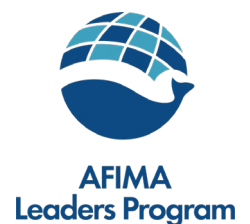
〈 Logo of the program 〉

Held an on-line exchange event, in which 18 graduate students from four universities participated. During the event, Special lectures on sustainable ocean environments and fisheries and short introduction by students were presented