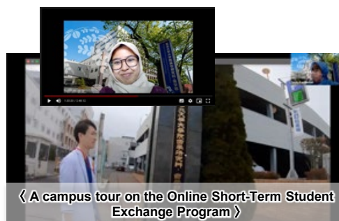
〈 A campus tour on the Online Short-Term Student Exchange Program 〉