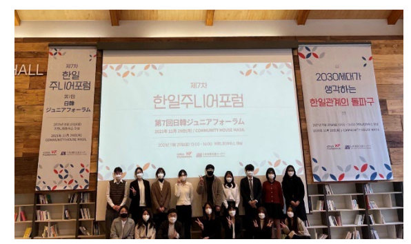
Korea-Japan Junior Forum Participants (Busan, South Korea)