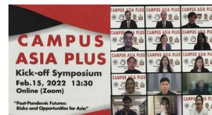
Campus Asia Plus Program Kickoff Symposium

▶ Campus Asia Plus Program Kickoff Symposium Held: In February 2022, the Campus Asia Plus Program Kickoff Symposium was held online to commemorate the approval of the program and the dissemination of its achievements.