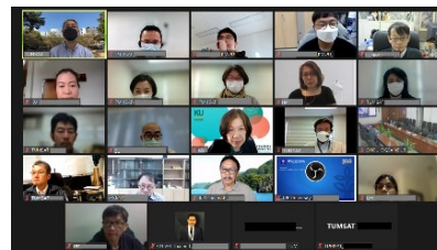
1st OQEAIOUS Plus Joint Meeting (December 2021)

In preparation for the implementation of IJP among seven universities, including four ASEAN Universities, in the Fall 2022 semester, a Joint Meeting was established to create new guidelines (tentative name: CTSEAA) based on the "CTSEA (Credit Transfer System in East Asia) Guidelines," a credit transfer system created in Mode 2 for equivalent quality assurance between the three universities in Japan, China, and Korea, with the four ASEAN universities added.