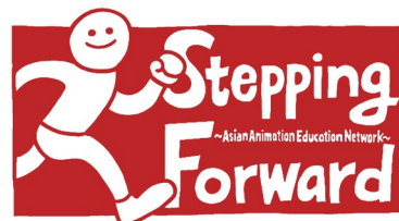
〈Kick-off Symposium Jan. 2022〉