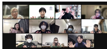
〈'Short Films & Discourse: Emotional Landscapes of International Students' Jan. 2022〉