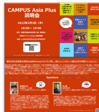
〈 Poster for the program information session held on February 3 〉

We worked on improving the educational content of “CAMPUS Asia Joint Course” for FY2022. New schemes are being planned, such as solution-based classes in collaboration with a local government and CAMPUS Asia alumni, and group work with students and bureaucrats from central government ministries. In addition, to compensate for the lack of communications caused by reduced face-to-face interactions, and to eliminate anxiety due to the prolonged pandemic, the faculty member in charge conducted a one-on-one counseling with each student.