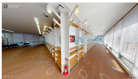
〈online VR Exhibition〉