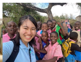
Long-term program activities