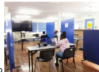
< Online Program in Kenya >