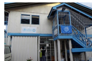
African Education and Research Station, Nagasaki University