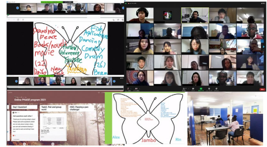
< Online Program >

An Online Program was held from Feb 15 to 26, 2021 with 12 students from Nagasaki University and 3 students from each of the partner institutions(12 students in total) . By having Japanese and Kenyan students work in pairs, they gained an understanding of cultural diversity and the importance of cross-cultural exchange. They were also able to share the importance of being interested in planetary health issues.