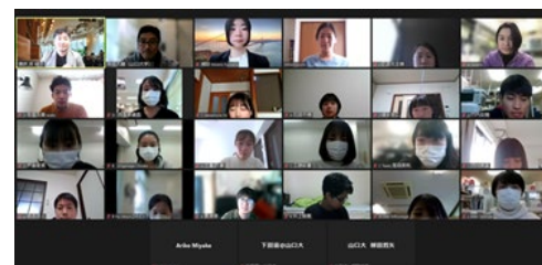
The Workshop for cultivating problem-solving skills