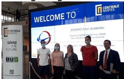
〈The first JEMARO students from overseas arrived in ECN (France)〉

The student exchange program began in 2020; however, due to the spread of the COVID-19 (coronavirus disease), students in Japan were not able to travel to Europe in the 2020 academic year. For Japanese students, all lectures and research activities, and for students in the EU, portions of lectures and research activities, were implemented online.