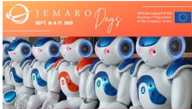
〈JEMARO DAYS Opening Screen〉

Due to the effects of the COVID-19 pandemic, exchange programs between Japan and Europe continued to be held online as they were in the previous academic year.