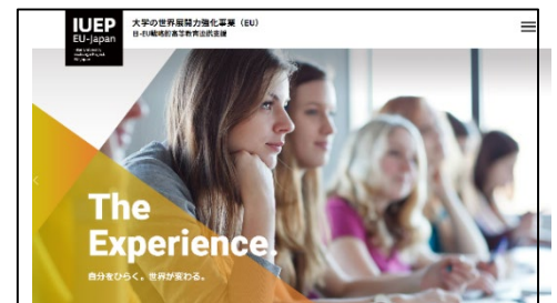
〈Platform-building Project website〉

We worked on branding for the platform-building project to enhance its capacity to circulate information. A specialized contractor took the lead in interviewing officials from the three participating universities, conducting workshops, and developing a shared logo and key messages. We redesigned the website to reflect these developments.