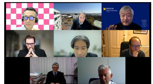
〈the Inter-University Exchange Project: Symposium〉

( https://www.global-sdgs.keio.ac.jp/sdgs/20220323/ ).