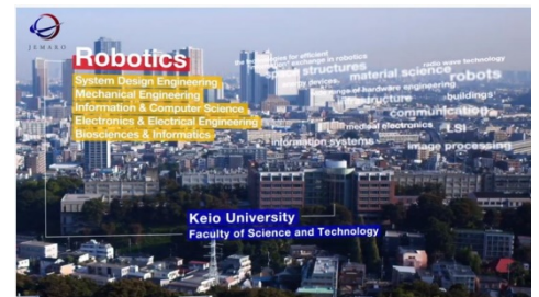
JEMARO video (English version)

From the very beginning of the selection process, we place a high value on the students' motivation and interest in research topics, selecting their academic advisors in Japan before their departure. We have established a system that allows students to engage in research under the supervision of both Japanese and European academic advisors even before arriving in Japan. Based on cooperation with our EU partner universities, we have assigned Japanese instructors for both the first (12 students including 3 Japanese nationals) and second cohorts (18 students including 2 Japanese nationals), ensuring that students have a clear indication of the joint supervision system that will be in place.