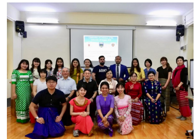
〈Externship in Myanmar, Feb. 2020〉