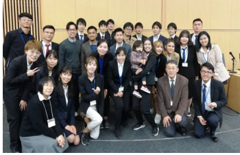
〈Workshop in Tokyo, Dec. 2019〉