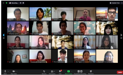
< Online Externship (September, 2020) >

Due to the worldwide COVID-19 pandemic, KLS carried out international exchange programs online base.