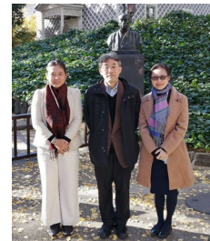
< Two LL.M. Students from Laos (Dec.2020)>