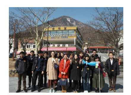
(Spring Camp in Nikko)

Outstanding way increasing outbound exchange students is that we provide a class of "Gakugei Frontier B" (Guidelines for studying abroad) to TGU students. It's a specially designed for undergraduate students as a regular course since FY2017 and aims to give students an opportunity to learn a significance of study abroad and making their own study abroad plan.