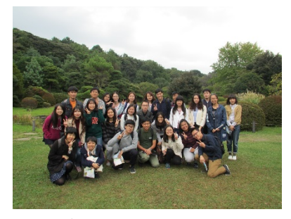
{Off-campus Learning at Koishikawa Botanical Garden>