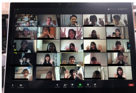
<CAP Language Café>