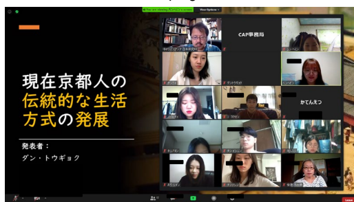
<Japan Research IV Presentations by Chinese and Korean Students>

Many students in the Chinese and Korean programs participated in the Online Cultural Exchange event sponsored by RU's Research for Living Life with Coronavirus: Visionaries for the New Normal Project. This event was not just an environment for the program participants to learn a specific language, but rather as an environment to practice translanguaging, providing an opportunity for them to enhance their learning outside the program during the pandemic, using online translation tools, helping each other, and listening closely to one another.