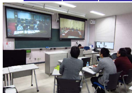
<The 1st CAP Faculty Council Meeting>

In early April, 15 faculty members in charge of courses related to CAP assembled to have meetings. During the meetings, the features of CAP were explained to new faculty members and information on classes was shared.