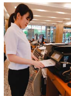
<Internship in Busan, Korea>

Internship programs were carried out in China and Korea both in the spring and fall semesters in AY 2018. A total of 18 CAP Students from Japan and Korea participated in the programs offered by 6 companies related to education and advertising businesses in Guangzhou, China. And a total of 17 CAP Students from Japan and China participated in the programs offered by 6 companies related to publishing and hotel businesses in Korea. A total of 9 international students studying in Japan participated in programs offered by 3 organizations/companies such as a city hall and media company in Japan. Students had good opportunities to turn their eyes to working overseas and global companies.