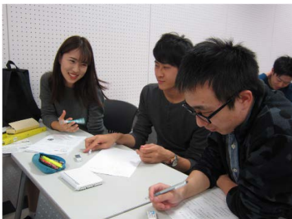
<Students interacting during a language course specially designed for the CAP students.>