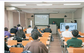
<Online International Symposium>