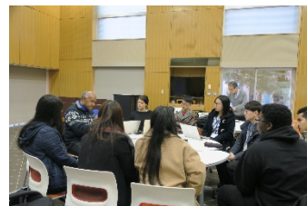
〈 Spring School : Workshop 〉

Okayama University organized the following programs and hosted 56 (China 22, Korea 34) students from Jilin and Sungkyunkwan University during the fiscal year of 2017: Exchange student of half to one year, Double degree program at Graduate School of Pharmaceutical Science, Short courses of 2 to 3 weeks including Language and culture, Spring School, Nano – biotechnology and Medicine programs.