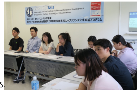
〈 Leaderships in the East Asia region: Student Forum〉