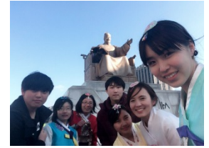
〈Inter-country workshops in Korea〉

Okayama University organized the following programs and hosted 52 students from Jilin and Sungkyunkwan University during the fiscal year of 2016: exchange student of half to one year (China 4, Korea 9), Short courses of 2 to 3 weeks including Language and culture, Spring School, Nano - biotechnology program (China 15, Korea 37)