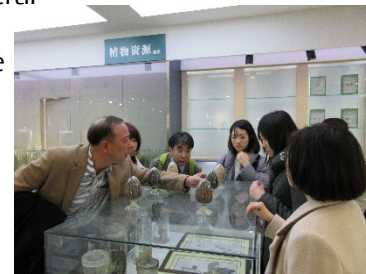
〈Environmental and life science seminar in Jilin University〉