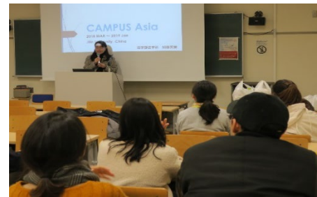
〈 Leaderships in the East Asia region: Student Forum 〉