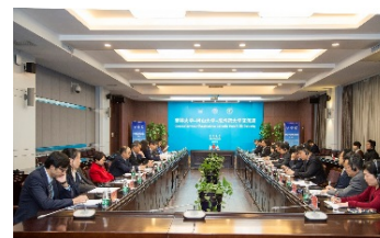
〈 Consotium meeting opening ceremony 〉

Through the agreement of cooperation among the three universities, exchange students receive provisions of a scholarship, free student housing and exemption of tuition fee from the host universities. Prior to their departure, students get comprehensive briefings from former exchange students and also faculty members in charge of CAMPUS Asia. Okayama University has managed the above arrangements through the Centre for Global Partnerships and Education. For inbound students, Japanese students provide peer supports in both academic and day to day life through attending classes together, interactions at language café. As for outbound students, a series of pre-departure orientation and guidance are provided including academic and security aspects as well as future career plans. During their stay abroad, periodical reporting and internet based communications have been arranged by the faculty member in charge of the program.