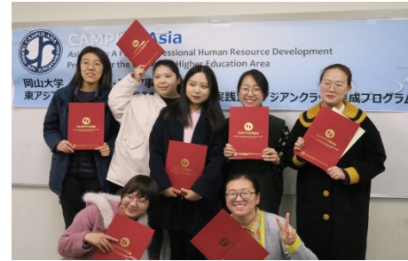
〈 Exchange student: 2018 closing ceremony 〉