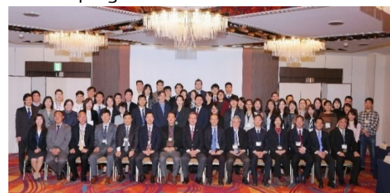
Joint International Symposium (Kobe, Japan)