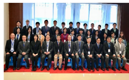
Joint International Symposium (Shanghai, China)