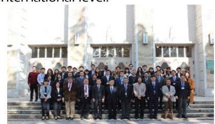
Joint International Symposium (Kobe, Japan)