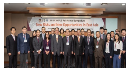
Annual International Symposium (Seoul, Korea)