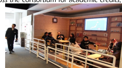
Experiencing Earthquake Simulator at Nijima Fault Fieldtrip to Awaji Island