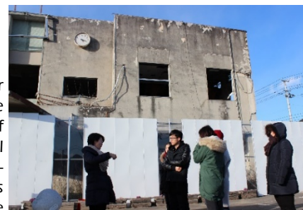
Fieldtrip to Tohoku Earthquake Stricken Area (Otsuchi-cho)