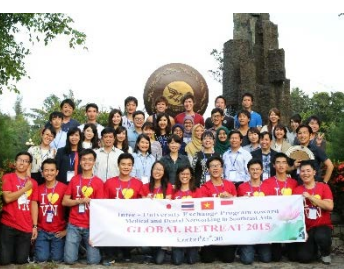
Global retreat held in Vietnam

Multiple international academic meetings, such as seminars and symposiums, were held in 2015 in Japan and overseas, with the purpose of improving the knowledge and skills of undergraduate students, graduate students and young researchers.