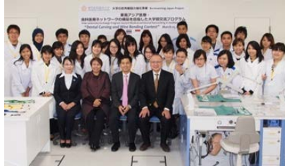
Dental skills contestants at the TMDU Dental Training Program