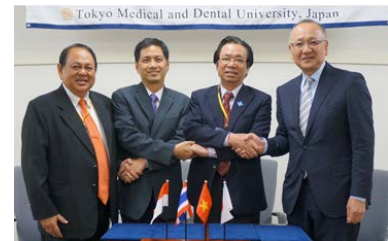
The deans of CU, UI, UMP and TMDU at the signing ceremony held at TMDU.

URL: http://www.tmd.ac.jp/grad/ohp/sekaitenkai/eng/