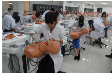
Skills Lab training in Indonesia

The purpose of this project is to implement the “International Medical and Dental Research Program” and the “International Medical and Dental Clinical Training Program,” both of which are aimed at undergraduate and postgraduate students. Faculties of Medicine of both CU and TMDU have agreed to recognize credits obtained through participation in these programs. In FY2013, TMDU created the “Dental Externship” as an elective to award credit to TMDU students who participated in programs overseas, including preparatory courses; in FY2014, CU and SWU also began offering credit to their own students who participated in exchange programs.