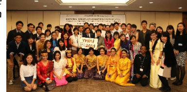
Dental training program (Inbound)

For the inbound program, the students with excellent grades are selected by dean's recommendation, in reference to their GPA. For the outbound program, a document review, an English interview by native teachers, and an interview by Japanese teachers, along with a written examination, are undertaken for the selection. In addition, the students of the Medical, Dental, and Oral health departments that participate in the outbound program receive credit recognition as part of the system implemented in the program. For the inbound students, the two universities of Thailand give credit recognition at the end of the program.