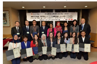
Students from Indonesia participated in Dental Medical Training Program.