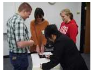
Class in Progress

Keio conducts mutual exchange of faculty members and students to renowned universities throughout the world and aim to cultivate future industry leaders who will play an active role globally by carrying out joint guidance for students from both institutions. Additionally, under the joint guidance carried out this past academic year, discussions concerning development of double degree Ph.D. programs have gained momentum and have opened up the door for future cooperative relationships with universities outside of Europe.