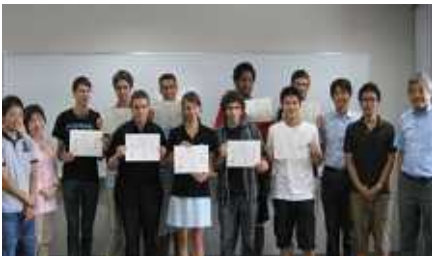
Class in Progress