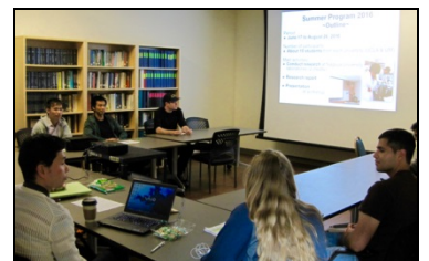
〈Program information session at UCLA〉

Inbound: Nagoya University provides all kinds of support, including university dormitories, counseling, Japanese classes, and careful mentoring by the hosting professors, teaching assistants, and the JUACEP team.