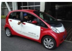
〈 Test drive of Mitsubishi i-Miev 〉