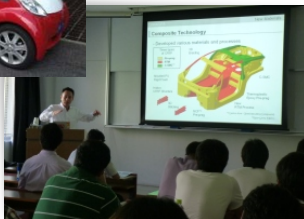
〈 Lecture on Lexus LFA 〉