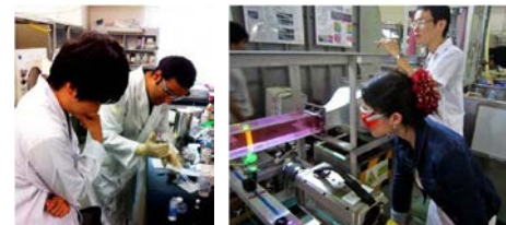
〈Michigan University students in Nagoya〉