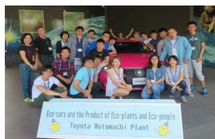
(Toyota plant tour)