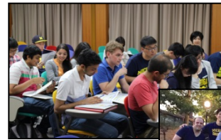
〈Orientation in Nagoya〉

Nagoya is called the "hub of Japanese technology." Nagoya University takes this advantage to provide hands-on research education by working closely with local but global industrial companies. The official agreement between NU and the Michigan universities allows credit exchange and transfer that ensures the quality of the program.