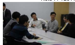
( Snapshots from the Faculty Workshop. (Left) networking between NU students and UM faculty; (right) Lab tour)

○ Inbound: Nagoya University provides all kinds of support, including university dormitories, counseling, Japanese classes, and careful mentoring by the hosting professors, teaching assistants, and the JUACEP team.