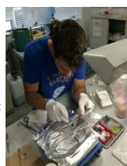
(UCLA student doing experiment in his lab at Nagoya University)