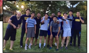
〈With friends at UM〉