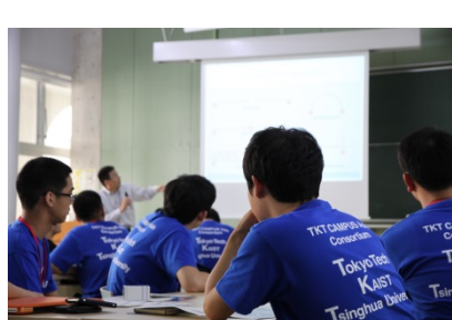
Summer Program students in lecture