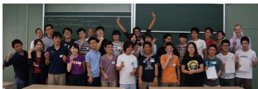
Students at a CAMPUS Asia lecture

Outbound students can either take courses in their fields of expertise while learning about the languages and cultures of China or Korea, or focus exclusively on research. Inbound students have three programs to choose from at Tokyo Tech; the Summer Program, the Joint Educational Program, or the Summer and Joint Educational Combined Program. Moreover, to assist partner universities with the possibility of credit transfers, the Institute uses Study and Research Plans/Records and a grade management system with commonalities to those of partner universities.