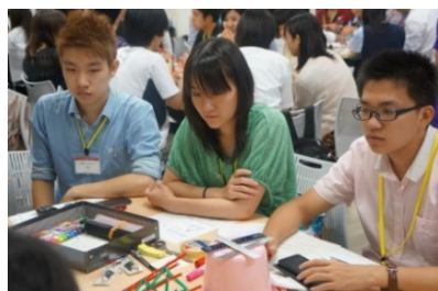
Summer Program students in group work