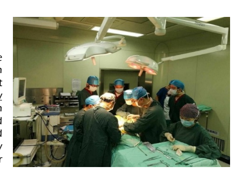
(Practice at the operating room = Niigata University)

Results of this inter-university exchange project continue spreading to other Russian medical universities. The inter-university agreement with St. Petersburg State University was concluded in 2016. In addition, we have concluded inter-faculty agreements with North-Eastern Federal University (Yakutsk), Institute of Fundamental Medicine and biology of Kazan Federal University and Kazan Medical University in 2017 and student exchange was started. Dean of Fundamental Medicine Faculty of Moscow State University also signed the inter-faculty agreement. It is planned to start student exchange from 2018.