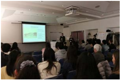
Russian students making presentation at the public lecture>

"Control Center" (consists of four staff members who can speak English or Russian) belongs to the School of Medicine, administrates and manages the project in cooperation with Academic Affairs Division, strictly ensuring academic progress and following credit transfer system. 2015 is the first year when actual results were gotten, so starting from the next year in order to make outbound/inbound students' academic and research achievements transparent, we will do our best to apply credit transfer system to all types of programs. Various Evaluation Committees and Internal/External Steering Committees meetings have been regularly hold, all the results thoroughly checked and advice given by experts followed in order to carry out the following project industriously.