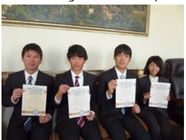
\( \) Students of Niigata University with certificates of completion \)

Construction of the global framework promoting the collaborative education and career development for young medical students in Japan and Russia