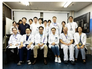
(Russian medical student in medical practice and stuffs of the hospital of University Tsukuba)

The University of Tsukuba Hospital accepted 11 medical students for a one-month practical training (Department of Renal urology, Cardiovascular surgery, Otorhinolaryngology, Gastroenterology, Cardiovascular surgery, Ophthalmology, Neurosurgery). One medical student from the University of Tsukuba participated in a clinical training at the Russian National Research Medical University and Novosibirsk State University (Department of Trauma surgery).