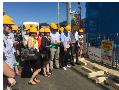
Internship in Japan for foreign students July 2015

With the aim of starting academic exchange with leading universities in Caucasus (Azerbaijan, Armenia and Georgia) and Moldova , in December 2015 faculty members of the University of Tsukuba went to Caucasus and Moldova and held discussions on the subject. As a result, Agreements on academic exchange were signed with Azerbaijan University of Languages (Azerbaijan), Free University of Tbilisi (Georgia), and Russian-Armenian (Slavonic) University (Armenia). Signing Agreement on academic exchange and starting cooperation with Moldova is scheduled to take place in 2016.