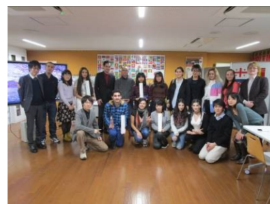
Japanese language and culture internship (December 2016)

Agreements on academic exchange with leading universities in Caucasus (Azerbaijan, Armenia and Georgia) and Moldova (Azerbaijan University of Languages (Azerbaijan), Free University of Tbilisi (Georgia), and Russian-Armenian (Slavonic) University (Armenia) and Moldova State University (Moldova)) were signed. This has marked a new level of cooperation with the Russian-speaking countries. In December 2016, Japanese language instructors from five countries participated in a Japanese language and culture internship held at the University of Tsukuba.