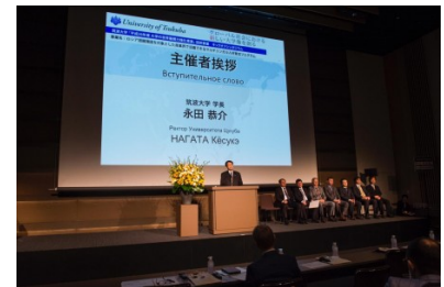
〈Symposium held on February 15, 2015〉

A MOU with Al-Farabi Kazakh National University was signed to cooperate in realizing a Campus-in-Campus initiative of mutual credit exchange system.