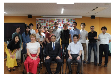
(Graduation ceremony for inbound students, August 2018. University of Tsukuba)

In January 2019 "Central Asia-Japan Human Resource Development Project" was established as a self-sustaining project subsidized by The Nippon Foundation. The purpose of this project is to develop human resources who can contribute to achieving SDGs and solving social issues in Central Asia by utilizing the know-how and networks of "Inter-University Exchange Project (Russia)".