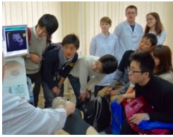
〈during an outbound internship〉