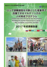
(Program outcome report 2017)

Two Japanese students from this program participated in the "Russian-Japanese Student Forum 2017" held in Vladivostok in September of 2017. The proposals discussed and compiled there were later presented to Prime Minister Abe by one of them.