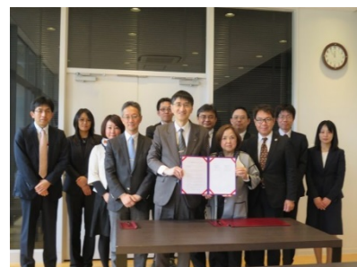
Signing agreement on academic cooperation with Tohoku University (March 2017)

In March 2017, an agreement on academic cooperation was signed between the “Global Education Program for Developing Multilingual Human Resources in Japan, NIS and Baltic countries” of the University of Tsukuba and the Tohoku University.