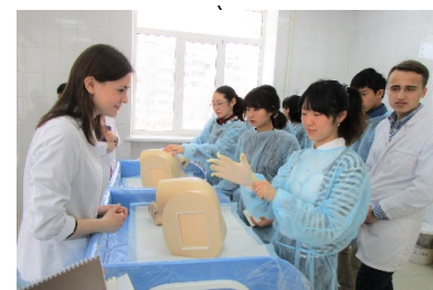
(Medical training, March 2017. Novosibirsk State Medical University)

With participation of instructors in charge from 7 Russian universities, a meeting of the joint-program committee was held to discuss various issues related to the program implementation. An emphasis was placed on credit exchange system between Russian universities and the University of Tsukuba. The meeting became a venue for information exchange, which will contribute to a further enhancement of the quality of the program implementation.