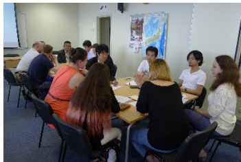
Discussion during an economic forum in Moscow (June, 2016)

Outbound students were in charge of organizing economic forums to enhance the cooperation between Russian-speaking countries and Japan. The forums focused on job-hunting and employment opportunities, tourism etc. Students from Russia and NIS countries studying in Japan obtained internship experience at homebuilder company Iida Sangyo Co., Ltd., where they were assigned practical tasks of proposing business plans etc.