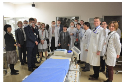
“Cooperation of young Japan-Russia medical specialists in regional medical care” Held in collaboration with Niigata University and Japan-Russia Youth Cooperation Center (February 2017)

New courses of “Internship abroad” (2 credits, started in 2015) and medical course “International life science practical course” (1 credit) have been included into curriculum. Credit system for internship courses will further ensure preserving a high quality of educational activities to inbound and outbound students.