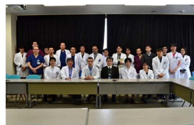
Internship students and staff of the University of Tsukuba Hospital

In May 2016, 2 medical students started their 1 month clinical training at the Russian National Research Medical University. The training is carried out within the framework of the “Medical training abroad” program (11 credits).