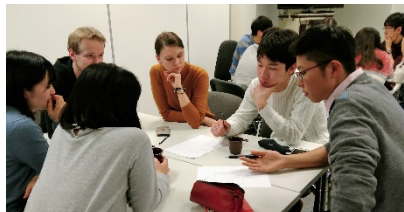
(Discussion by Japanese and Russian students during an economic forum. February 2018.)

•Economic forums and internship programs in Japan, Russia and Russian-speaking countries