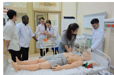
(Medical training, February-March 2018. Kazan Federal University)

The 4th External Evaluation Committee meeting was held on February 1, 2019. The committee reported on the program's performance of this year and the students of this program presented their activities. The committee members evaluated the program and proposed improvements of the system of public relations.