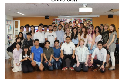
(Graduation ceremony for inbound students, August 2017. University of Tsukuba)

In February 2018, Program Outcome Report was published. In addition, with the renewal of the program's website, program outcomes were circulated.