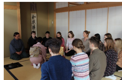
(Japanese language and culture internship, December 2018. University of Tsukuba)

41 students out of 51 Japanese students who took part in the Program received credits for their study abroad/foreign internship. Program courses include "Language training abroad" (3 credits), "Project training abroad" (2 credits), "Internship abroad" (2 credits), "Clinical clerkship III" (11 credits), which have been incorporated into curriculum of the University of Tsukuba. Awarding credits for internship courses ensures preserving a high quality of the program's educational activities.