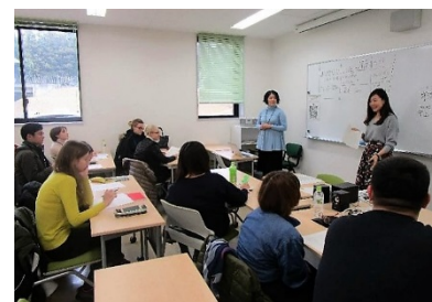
(Japanese language and culture internship, December 2017. University of Tsukuba)

57 students out of 64 Japanese students who took part in the Program received credits for their study abroad/foreign internship. Program courses include "Project training abroad" (2 credits), "Internship abroad" (2 credits), "Clinical clerkship III" (11 credits), which have been incorporated into curriculum of the University of Tsukuba. Awarding credits for internship courses ensures preserving a high quality of the program's educational activities.