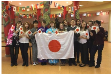
Cultural exchange between Japanese and Russian students in Moscow