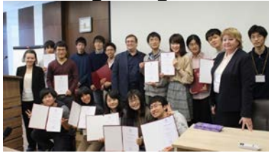
〈Closing ceremony at NSU〉