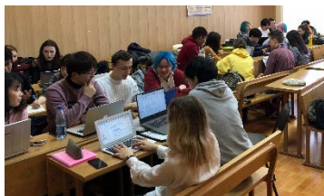
(Joint Study Activities at MSU)

Exchanges were successfully conducted at all stages of the multi-step Student Exchange Programs. Furthermore, joint laboratory activities were carried out through joint research and graduate level joint education programs, special lectures for students were provided by joint researchers, and the students participated in joint seminars. The latter played an important role in establishing an international academic network during their doctoral studies. There was additional success in the acceptance by an international journal of a co-authored paper, of which a student was the lead author.