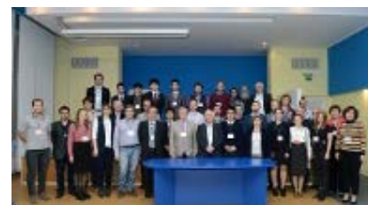
(Materials Science Joint Seminar)