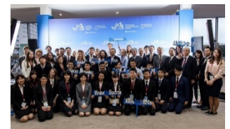
The Russia-Japan Student Forum was held in Vladivostok