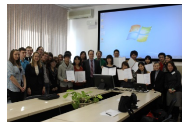
〈 Tohoku University Cross-Cultural Program with Russia 〉