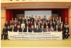
Materials Science Joint Seminar hosted at TU with NSU and SB RAS