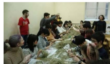
(Cross-cultural experience exchange program)