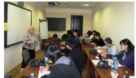
〈 Russian language lessons at MSU 〉

• Establishment of an Inter-university Education Board The Inter-university Education Board aims to develop and implement a jointly supervised degree system. Additionally, they aim to oversee planning student exchange programs, agreements on credit transferable courses, and plan education exchanges through cooperative research.