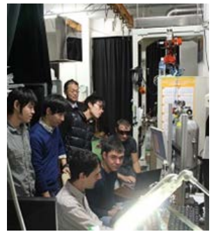
〈TU students studying at a joint laboratory with FEFU researcher〉