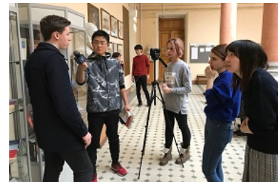
Cooperative Learning with the MSU Faculty of Journalism during a short-term exchange program