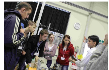
〈 Engineering Lab tour at TU 〉