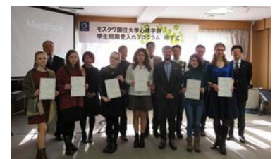
〈Closing Ceremony for exchange students from the MSU's Faculty of Psychology enrolled at the TU Graduate School of Arts and Letters〉