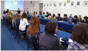
〈 Group work at MSU 〉

A short-term cultural exchange program was carried out at Moscow State University (MSU). For inbound students, in addition to summer programs, there were also specialty programs in Engineering and Psychology. In research and education exchanges, professors give lectures overseas, online seminars, and dispatch of graduate students for short terms. Joint seminars on cutting-edge research were held 11 times. The jointly supervised degree system with MSU is expected to be approved and begin in the next year.