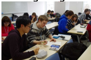
〈 Group work with Russian Students 〉

Short-term cultural exchange programs have already been carried out in both countries. Additionally, semester-term exchange programs to be issued credits have also been successfully completed. Joint seminars on cooperative cutting-edge research have also been held successfully with the aim of graduate level joint education.