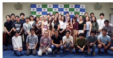
Japanese and Russian students taking Basic Subjects in FY 2016

An HU student took Advanced Subjects at a Russian partner university, receiving technical guidance from Russian faculty members and using the expertise gained in his thesis writing.