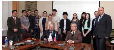
Japanese and Russian academic staff and students at a lecture on a prep subject