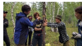
Fieldwork activity involving environmental observation in Yakutsk as part of Basic subjects