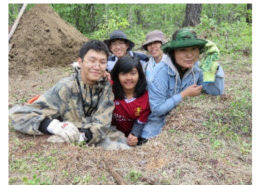
(Basic Subject – Practical training in Yakutsk: permafrost soil survey)

Members from local municipality as well as local companies in Hokkaido joined this meeting and actively discussed this year's theme " Collaboration among universities and companies for future".