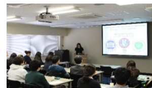
Completion report by a Russian student at Sustainable Development Study Group