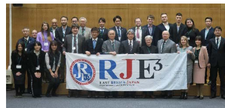
(RJE3 Summary Symposium)

Reports written by students participated, information on events and related activities were immediately posted on the RJE3 Program website and social media. The FY 2018 Progress Report, the Course Guide for FY 2019 and 2 newsletters were also published.