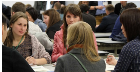
Lecture on a basic subject (trial)