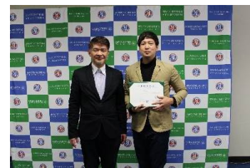
(RJE3 joint completion certificate award ceremony)

The Central Office for the RJE3 Program at HU and the Liaison Desks at the Russian partner universities collaborated closely to conduct affairs related to hosting dispatched Japanese and Russian students. Regarding hosting Russian students, the Central Office also collaborated with the Academic Affairs Divisions of host departments at HU to host students on a long-term basis.