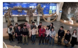
Short-term dispatch of Hokkaido University students under Prep subjects (Yakutsk)

By ensuring the consistency of advanced courses in educational curriculums and registering advanced courses as regular ones, arrangements were made to offer them the following year.