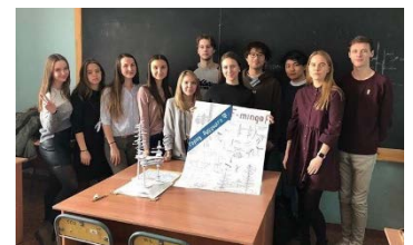
(Prep. Subject – Architecture work created by Russian and Japanese students)