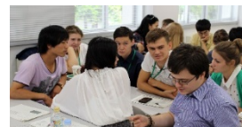
Discussions between Japanese and Russian students in Basic subjects (introduction)