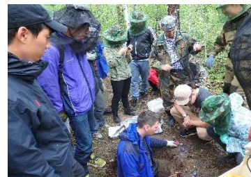
(Basic Subject – Practical training in Yakutsk: permafrost soil survey)

An outside lecturer delivered a lecture on networking with Russia and exchanged opinions with participants regarding the future continuation and development of the program