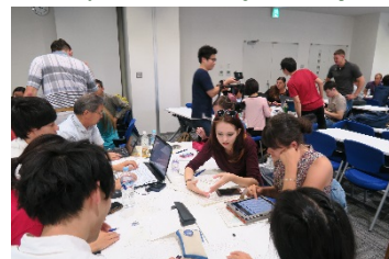
(Basic Subject – Introductory course: discussion among Japanese and Russian students)