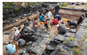
International Field School on Rebus Island Hamanaka 2 site, Rebus Island Basic Subject fieldwork