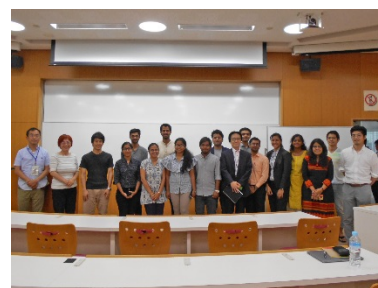
〈 Research Exchange Meeting 〉

•JAIST set up a laboratory operated jointly with IITGN in order to maintain close relationship with IITGN and implement research supervision smoothly under the double degree program. JAIST also offered a collaborative course conducted by faculty members of JAIST and IITGN jointly and it is regarded as a mandatory course for students participating in the program.