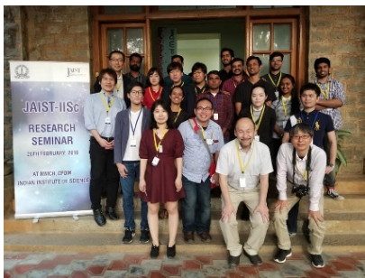
〈 Seminar in India 〉

○JAIST conducted short-term mutual student exchanges aimed to participate in international seminars, accepted undergraduate students from partner institutions as the visiting students, and carried out mutual student exchanges for 2 to 3 months under the collaborative education and research co-supervision program.