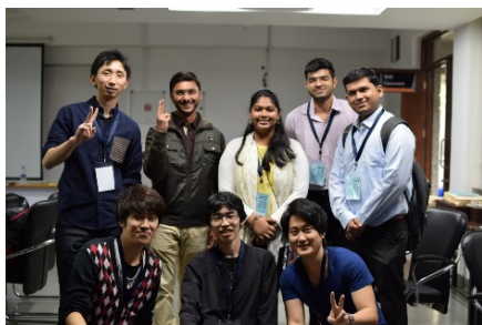
〈 Seminar in India 〉

○JAIST conducted short-term mutual student exchanges aimed to participate in international seminars, accepted undergraduate students from partner institutions as the visiting students, and carried out mutual student exchanges for 2 to 3 months under the collaborative education and research co-supervision program. ○For Japanese students participated in an international seminar, the result of their participation was approved as academic credit by combining with classroom lectures. For Japanese students conducted their research under the collaborative education and research co-supervision program, an internship opportunity was provided at a Japanese company's branch in India. ○The Memorandum of Agreement (MoA) on Double Master's Degree Program has been concluded between JAIST and Indian Institute of Technology Gandhinagar (IITGN).