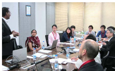
〈 Visiting a company in Bengalure 〉