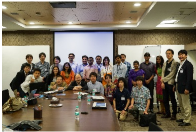
〈 Visiting a company in Bengaluru 〉

○JAIST held international workshops and seminars both in Japan and India, and promoted student exchanges. The one held in Bengaluru, India included visiting to Japanese companies' branch offices and opportunities to hear situation of industry in Bengaluru from staff working there.