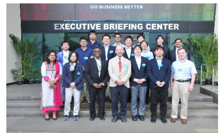
〈 Company visit in Bangalore 〉