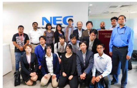
〈 Company visit in Bangalore 〉