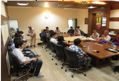
〈 Workshop in India 〉

○JAIST conducted short-term mutual student exchanges aimed to participate in international workshops, accepted undergraduate students from partner institutions as the visiting students, and carried out mutual student exchanges for 1 to 3 months under the collaborative education and research co-supervision program.