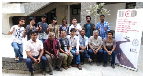
〈Workshop in India〉

○JAIST conducted short-term mutual student exchanges aimed to participate in international workshops, and accepted undergraduate students from partner institutions as special visiting student continuously from FY2014. In addition, JAIST started mutual student exchanges from 1 to 3 months as collaborative education and research co-supervision programme.