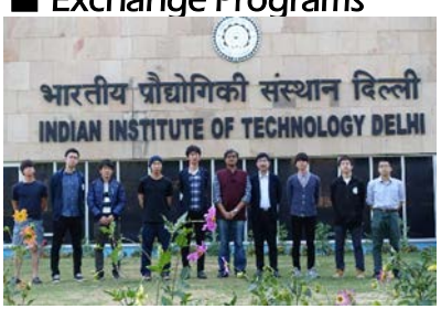
(Visit to IIT Delhi)