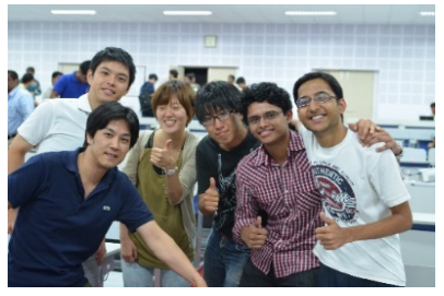
Innovation school at IIT-H

5 programs in progress for promoting India-Japan educational collaboration Railway Engineering: IIT-K professor gave a lecture at UTokyo and attended an International Conference in Tokyo.