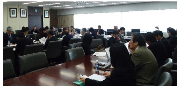
〈Picture3: Selected Universities' Meeting 2018.1.10 〉

· Faculty members from UTokyo visited IIT Kharagpur, briefing sessions for the Ministry of Railways Ministry of Government Scholarship Program and IIT Bombay to ask members for cooperation, to exchange opinions and listen to requests for this project. In addition, we used public information briefing sessions to publicize the project.