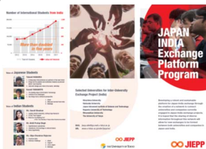
〈Picture2: Leaflet 〉