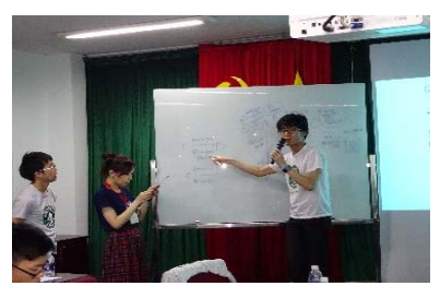
⟨Presentation by Japanese students at the study program in Vietnam in March 2017 ⟩

We are applying the quality assurance system which are used by KLS-J.D. Course: the evaluation of GPA and Faculty Development. We are sharing this quality assurance system with our partner universities. Moreover, KLS has established Keio Institute for Global Law and Development: KEIGLAD and gather necessary information to make advance the PAGLEP.