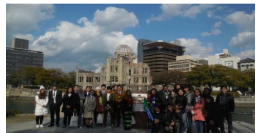
Cultural Study (Hiroshima Peace Memorial Park)