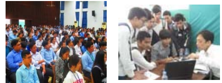
PEACE Student Exchange Program Information Session at the Institute of Technology of Cambodia