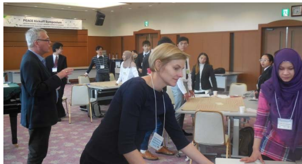
PEACE-SDGs Idea Mining Student Seminar, coordinated by idea mining experts from the University of Münster, Germany