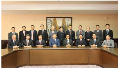
Conclusion of MOUs with 6 Royal Universities in Cambodia