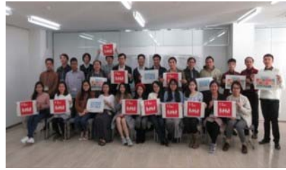
PEACE-SDGs Student Seminar at Hiroshima University of Economics