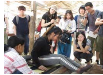
Visit to a Local NPO during the Study Tour in Cambodia