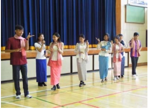
International students from the Royal University of Phnom Penh (Cultural interchange at an elementary school)