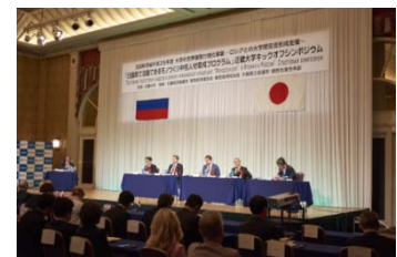
〈The Kick Off Symposium〉