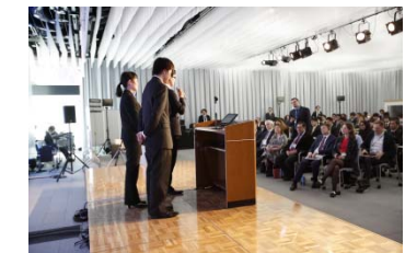
〈The Kick Off Symposium〉