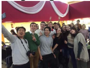
〈The short term exchange program〉