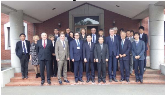
〈Management Committee Meeting〉