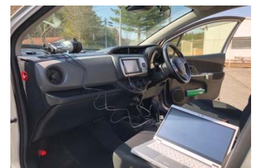
〈In-vehicle Radiation Monitoring System〉