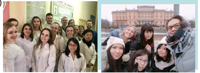
〈With BSMU students of the seminar〉 〈Fellowship with NWSMU students〉