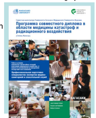
〈Course pamphlet in Russian〉