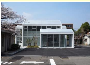
〈Nagasaki Univ. Guest house〉