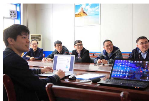
Research Presentation at Shandong University, China