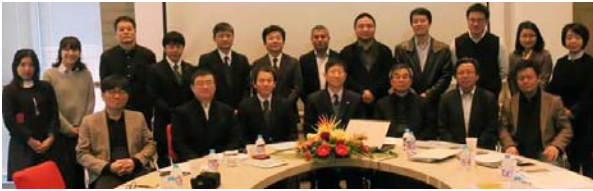
Three Universities Meeting in Shanghai