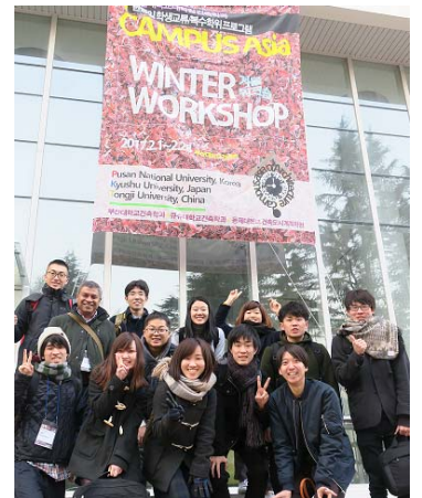
Pusan Winter Workshop in 2017