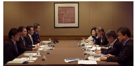
〈 2017/8/25 Accreditation Committee 〉

The Accreditation Committee was held on August 25 th , and the committee members have joined from other universities. We set 6 criteria to evaluate the program in order to assure the quality. We earned "A" rating for almost all of the evaluation criteria.