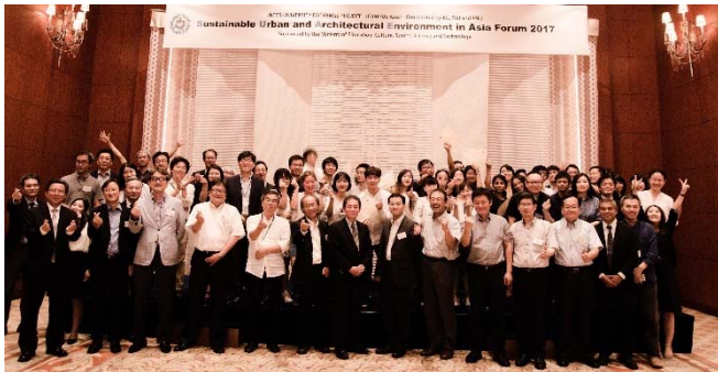
〈 2017/8/25 SUAE Asia Forum 2017 〉

The exchange program conducted with the collaboration of Pusan National University and Tongji University in 2017 was a great success, and 114 students from three universities participated in international workshops. Especially, 21 students from three universities participated the Summer School 2017. It offered a great opportunity for students from three universities to gather in Fukuoka and present their unique Urban Design proposal. Furthermore, the SUAE Asia Forum 2017 and a symposium was held during this summer school to exchanged the experience of internationalization of education such as student-mobility, promoting students to study abroad and credits transfer system among universities.