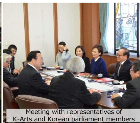
Meeting with representatives of K-Arts and Korean parliament members