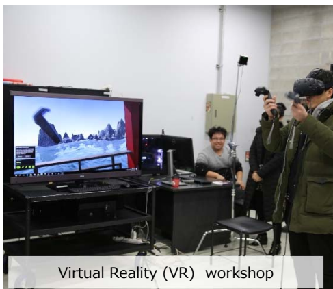
Virtual Reality (VR) workshop