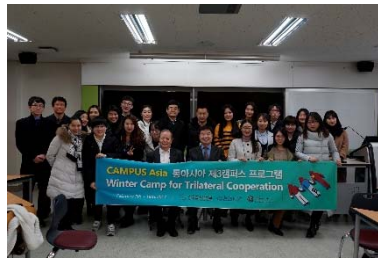
〈WPTC in SNUE〉

TGU sent 3 students to BNU for 1 year as exchange students.