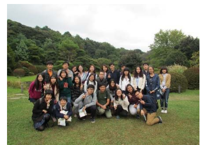
〈Off-campus Learning at Koishikawa Botanical Garden〉