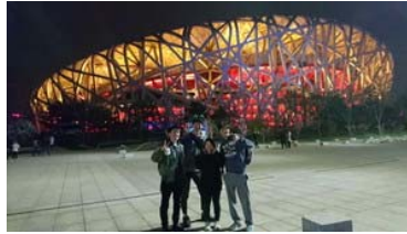
〈Exchange Program at BNU〉

TGU have offered various mutual exchange programs, such as short-term language and cultural programs taking advantage of the teacher training university's characteristics. TGU have achieved the more number of exchanges than planned initially.