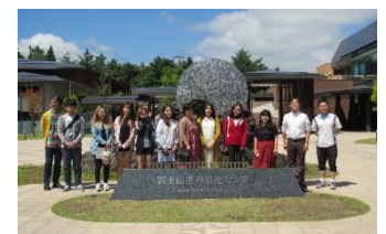
〈Spring Camp in Yamanashi〉

A coordinator, a full-time staff and a part-time staff were assigned in order to implement CAMPUS Asia Program in 2017. Also, CAMPUS Asia Office and Committee was established as a schoolwide organization for connecting the curriculum of undergraduate / graduate school and international activities. It newly set up CAMPUS Asia Lounge as the communication and learning space for exchange students, as well as developing and running the program.