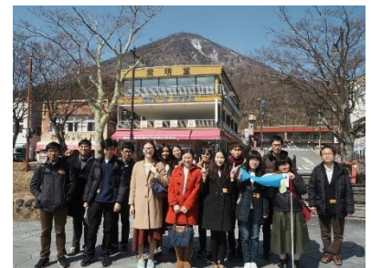
〈Spring Camp in Nikko〉