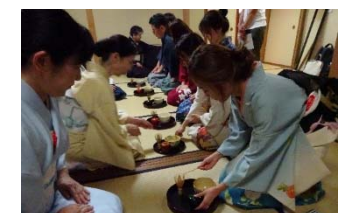
〈Japanese Culture Experience in SPTC〉

TGU is surely advancing globalization through CAMPUS Asia. The number of outbound students of long/short-term programs to China and Korea are increasing, and satisfaction of the inbound students is getting higher. The study achievement of out/inbound students was published as "The Collection of Training Report" so as to open and spread the information of the project. The newsletter is issued regularly by outbound students of exchange program in China and Korea, and the camp reports of inbound students also can be viewed on the website.