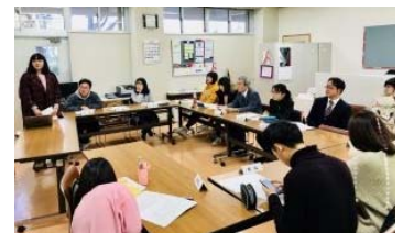
〈Final presentation of incoming exchange students〉

CAMPUS Asia Program of this project consists of short-term training, exchange program and Double Degree Program (DDP). TGU, BNU and SNU advanced consideration for implementing DDP referring the precedents of Japan and overseas, while 3 schools repeatedly discussed about education organization, curriculum, credit recognition and exchange, and degree-granting policy. The overview of CAMPUS Asia Program and students' opinions are publicly available on the website and brochures. It shows that the quality is guaranteed properly inside the program.