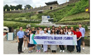
〈Summer Program at SNU〉