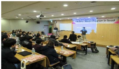
< Winter Program in Seoul >

<Type A-②Student-Exchange Program> <Type A-② Short-Term Program>