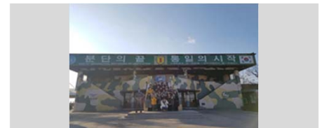
〈On field trip during winter program at SNU〉