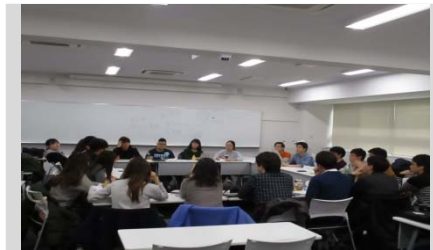
〈Group work during winter program at UTokyo 〉