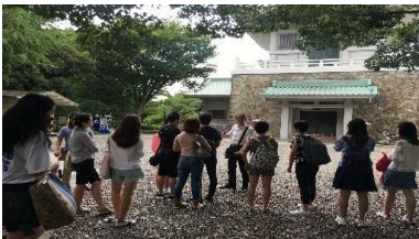
< Summer Program in Tokyo >