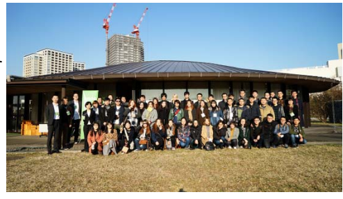
Chiba University CAPE Winter Workshop in FY 2016

In FY 2016, Chiba University, Tsinghua University and Zhejiang University in China, and Yonsei University in Korea each held at least one workshop for a total of five. A total of 263 students (including students not from partner universities) participated. An international symposium where faculty members and students from each university presented their research was held at the Kashinoha Campus, Chiba University in February. In FY 2017, each university continues to offer workshops as well as aims to increase the number of students participating in long-term study abroad programs.