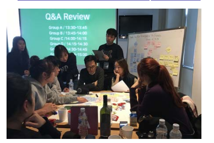
The joint workshop at Yonsei University, Korea

High quality workshops, which are in cooperation with partner universities, private businesses, and public offices, are implemented. Quality is ensured by mandating that each partner university send at least one faculty member to each workshop and requiring participants to study before and after each workshop. Afterwards, students who participate in the workshops are given a certificate of completion as well as credits after their work is graded. At Chiba University, all the courses offered in this program are considered graduate-level general education subjects and are registered as common courses among graduate schools.