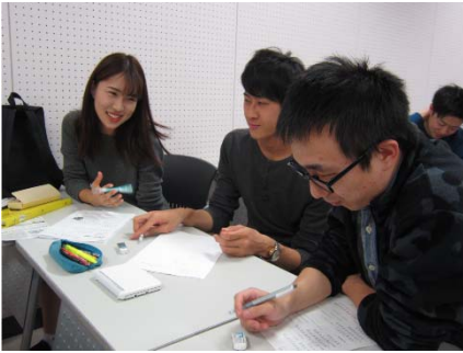
<Students interacting during a language course specially designed for the CAP students.>