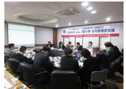
<Joint council meeting of faculty members from the three universities held in Busan, Korea.>