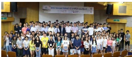
〈Summer School in PNU 2016/8/16~8/26〉

◆CSS EEST 18 th Seminar in SJTU 49 students including doctoral students joined CSS EEST seminar hosted by SJTU to share research interests and exchange opinions.