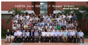
Summer School (SJTU)

PNU conducted Spring Seminar held in Gyeongju, Korea, and 11 EEST course students joined and fulfilled international research exchange for 3 days.