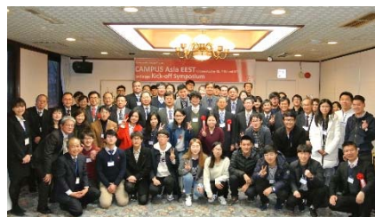
〈Kick-off Symposium in KU 2017/2/22〉

◆CA 2 nd stage Kick-off Symposium in KU KU hosted Kick-off Symposium to relaunch CA program in FY 2016.