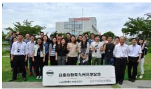
Field Trip to Kitakyushu