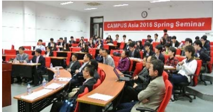
〈Spring Seminar in SJTU 2016/4/26~4/28〉

◆Spring Seminar in SJTU 12 KU students joined Spring Seminar hosted by SJTU in April.