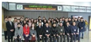
Spring Seminar (PNU)