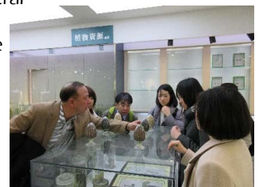
〈Environmental and life science seminar in Jilin University〉