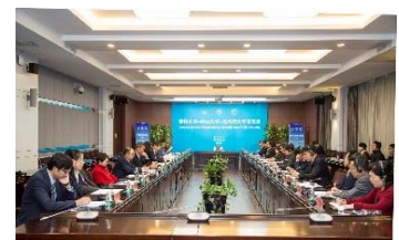
〈 Consortium meeting opening ceremony 〉