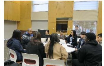
〈 Spring School : Workshop 〉