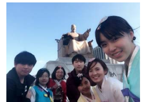
〈Inter-country workshops in Korea〉