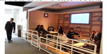
Experiencing Earthquake Simulator at Nojima Fault Fieldtrip to Awaji Island