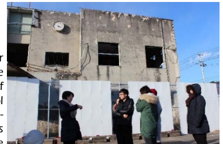
Fieldtrip to Tohoku Earthquake Stricken Area (Otsuchi-cho)