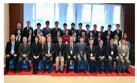
Joint International Symposium (Shanghai, China)