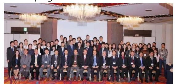
Joint International Symposium (Kobe, Japan)