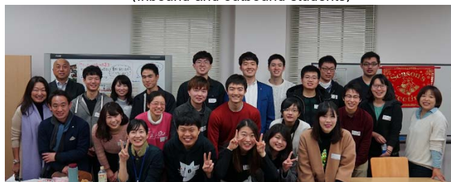
〈Inbound and outbound students〉

A 21 st Century Skills Seminar focused on communication skills was held for outbound Tokyo Tech students and their inbound counterparts. For those already studying overseas, the project offers academic consultations and advice on everyday living through email communication with a project coordinator.