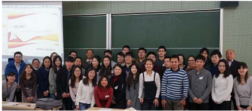
<21 st Century Skills Seminar>

The following activities were implemented in FY 2016.