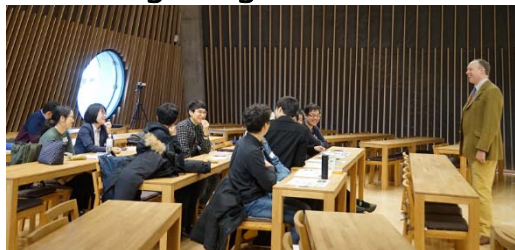
〈21 st Century Skills Seminar〉