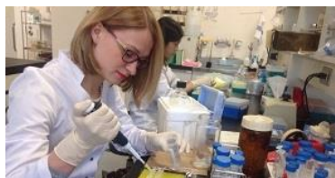
〈Graduate student performing the experiment〉

Four exchange programs started in 2015: "undergraduate student exchange" (Summer exchange program・Autumn medical research training program) and "graduate student exchange" (Regular PhD program<RPP>・Double degree program<DDP>). "English" is the language of the project. According to the agreement signed with three universities, FD and presentations of research projects were organized; project's office on the Russian side (Krasnoyarsk State Medical University) was set up to coordinate student exchanges and research activities. This program graduate's association was organized in order to maintain friendly relations after studying abroad.