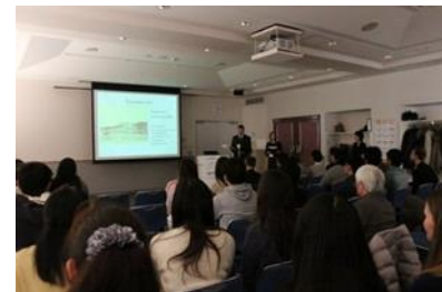
〈Russian students making presentation at the public lecture〉

"Healthcare center" which consists of four doctors including psychiatrist was established within the University to support foreign students. This organization can take care about physical and mental health of students. We also made a list of 8 hospitals located in Niigata city where students can communicate with doctors in English, so students can go there if they have health problems and in case of emergency as well. As for the Japanese language learning support, it should be mentioned that invited lecturers gave a course of lectures in "Medical Japanese". From 2016 Japanese became a part of syllabus for foreign students of the Medical and Dental Schools. Niigata University together with partner universities organized "Japan-Russia Emergency Contact Network" for inbound and outbound students, assistance is available 24 hours a day. For both Japanese and Russian students fully equipped accommodation within the campus or near is available for free.