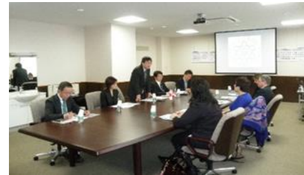
<Conference on International Cooperation Management >

Together with Academic Affairs Division of Niigata University School of Medicine we have managed the strict credit transfer and accumulation system for PhD students. Control Center which is responsible for the entire program management and public relations was organized. In addition, University Steering Committee and International Steering Committee were set up. Conference on International Cooperation Management was held in March. It gave a chance to discuss problems and difficulties of the project implementation, to share the necessary information. Working group consisting of competent professionals was also organized, it helped to improve the program a lot.