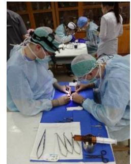
〈 At Far Eastern Federal District Regional Student Surgical Olympics 〉

Administration of the entire project and public relations are carried out by Control Center. International Cooperation Steering Committee was held four times last fiscal year and at the end of the fiscal year Internal and External Evaluation Committee meetings were held. Results of the consultation and advice from evaluation committees were included in the business plan of this fiscal year and widely reported on symposiums, workshops and FDs. Results of this inter-university exchange project can be already seen and it continues to spread to other medical universities in Russia. It is planned to engage more Russian universities in the project. St. Petersburg State University, North-Eastern Federal University (Yakutsk) and Kazan Federal University plan to join Summer Exchange Program.