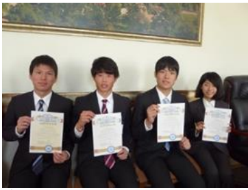
〈 Students of Niigata University with certificates of completion〉

Construction of the global framework promoting the collaborative education and career development for young medical students in Japan and Russia