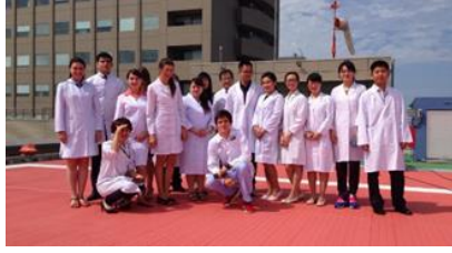
<Summer medical student exchange program 2015>

2014 was a preparation period in order to establish a full-fledged program, so we laid the groundwork of future student exchanges which will in fact start in 2015. At first, we have established a Control Center which consists of competent professionals with necessary language skills and rich international experience in order to set up the collaboration with partner universities in a close contact. In addition, a booklet, leaflets were issued and project website was created in order to introduce this project widely, not only in medical campus but within the whole university. Sessions of Internal and External Steering Committees, Evaluation Committee hearing were held; people in charge of the project and Control Center personnel visited partner universities several times, held meetings and carried out FD in order to explain the program content fully; administrative and management systems of the project were set up.