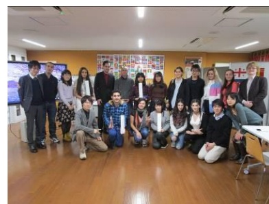
Japanese language and culture internship (December 2016)

Agreements on academic exchange with leading universities in Caucasus (Azerbaijan, Armenia and Georgia) and Moldova (Azerbaijan University of Languages (Azerbaijan), Free University of Tbilisi (Georgia), and Russian-Armenian (Slavonic) University (Armenia) and Moldova State University (Moldova)) were signed. This has marked a new level of cooperation with the Russian-speaking countries. In December 2016, Japanese language instructors from five countries participated in a Japanese language and culture internship held at the University of Tsukuba.