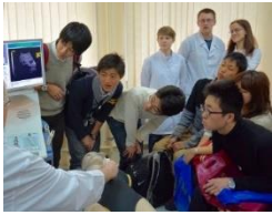
〈during an outbound internship〉