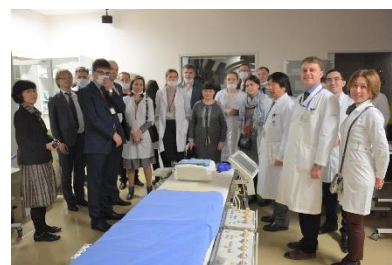
“Cooperation of young Japan-Russia medical specialists in regional medical care” Held in collaboration with Niigata University and Japan-Russia Youth Cooperation Center (February 2017)

New courses of “Internship abroad” (2 credits, started in 2015) and medical course “International life science practical course” (1 credit) have been included into curriculum. Credit system for internship courses will further ensure preserving a high quality of educational activities to inbound and outbound students.