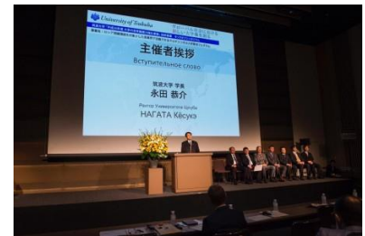
〈Symposium held on February 15, 2015〉

A MOU with Al-Farabi Kazakh National University was signed to cooperate in realizing a Campus-in-Campus initiative of mutual credit exchange system.