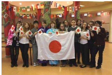
Cultural exchange between Japanese and Russian students in Moscow