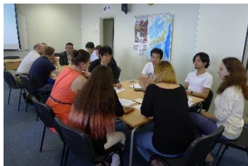
Discussion during an economic forum in Moscow (June, 2016)

Outbound students were in charge of organizing economic forums to enhance the cooperation between Russian-speaking countries and Japan. The forums focused on job-hunting and employment opportunities, tourism etc. Students from Russia and NIS countries studying in Japan obtained internship experience at homebuilder company Iida Sangyo Co., Ltd., where they were assigned practical tasks of proposing business plans etc.