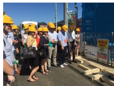
Internship in Japan for foreign students July 2015

With the aim of starting academic exchange with leading universities in Caucasus (Azerbaijan, Armenia and Georgia) and Moldova , in December 2015 faculty members of the University of Tsukuba went to Caucasus and Moldova and held discussions on the subject. As a result, Agreements on academic exchange were signed with Azerbaijan University of Languages (Azerbaijan), Free University of Tbilisi (Georgia), and Russian-Armenian (Slavonic) University (Armenia). Signing Agreement on academic exchange and starting cooperation with Moldova is scheduled to take place in 2016.