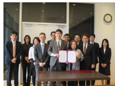
Signing agreement on academic cooperation with Tohoku University (March 2017)

In March 2017, an agreement on academic cooperation was signed between the “Global Education Program for Developing Multilingual Human Resources in Japan, NIS and Baltic countries” of the University of Tsukuba and the Tohoku University.