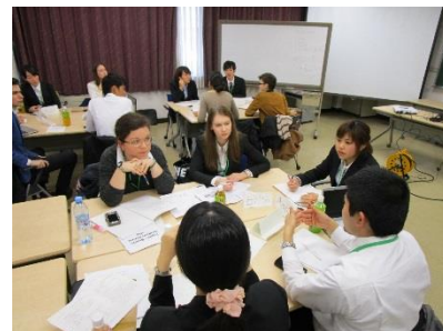
Discussions between Japanese and Russian students at the Japan-Russia student forum December 2015

New courses of "Internship abroad" and "Internship in Japan" (2 credits each) started in 2015 and a launch of "Project internship abroad" course in 2016 was finalized. These courses will ensure preserving a high quality of educational activities to inbound and outbound students.