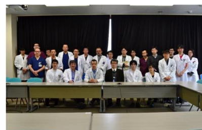
Internship students and staff of the University of Tsukuba Hospital

In May 2016, 2 medical students started their 1 month clinical training at the Russian National Research Medical University. The training is carried out within the framework of the "Medical training abroad" program (11 credits).