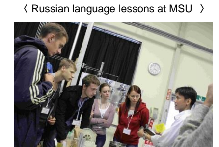
〈 Engineering Lab tour at TU 〉

supervised degree system. Additionally, they aim to oversee planning student exchange programs, agreements on credit transferable courses, and plan education exchanges through cooperative research.